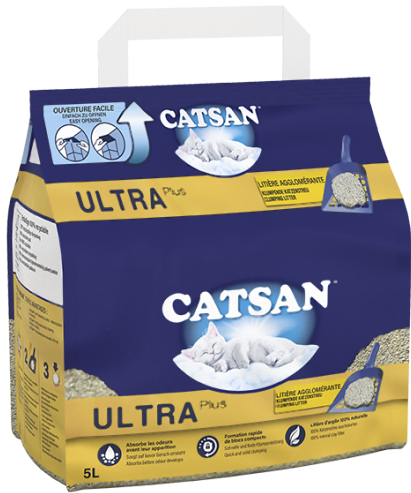
CATSAN™ ULTRA Plus